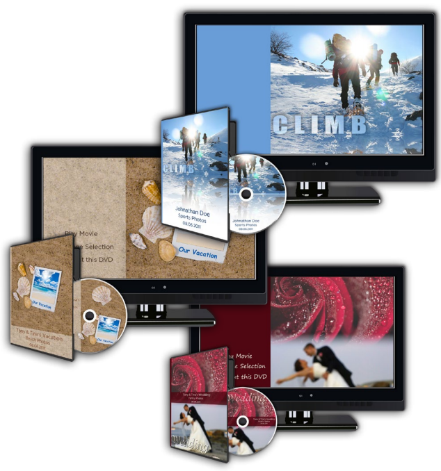
Variety of User Templates